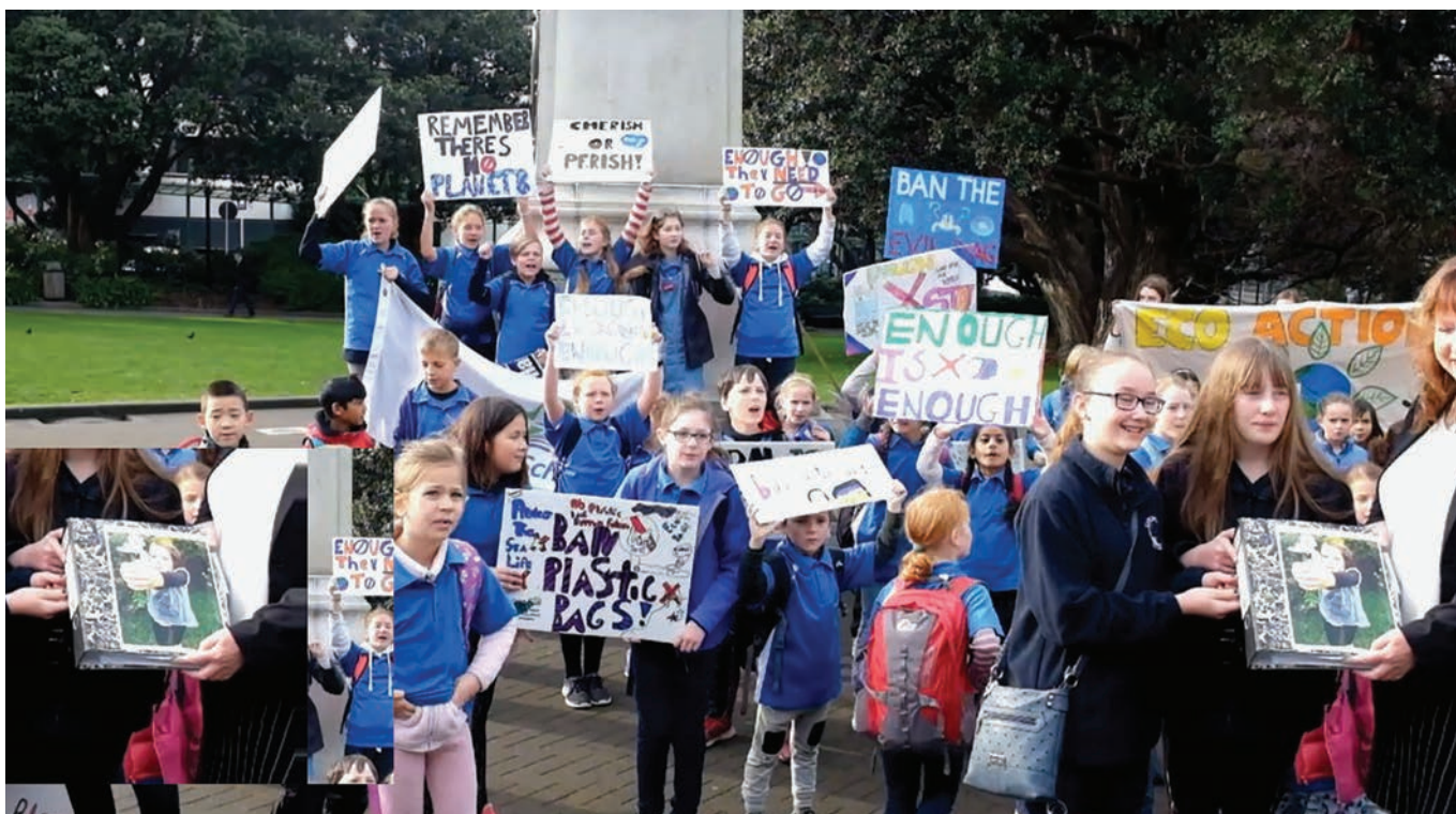
Above: North and South Island Schools calling for a ban on plastic bags, parliament grounds.

Matike Mai Aotearoa, (2016). He Whakaaro Here Whakaamu mō Aotearoa: Report of Matike Mai Aotearoa. The Independent Working Group On Constitutional Transformation. Retrieved from: http://www.converge.org.nz/pma/MatikeMaiAotearoaReport.pdf