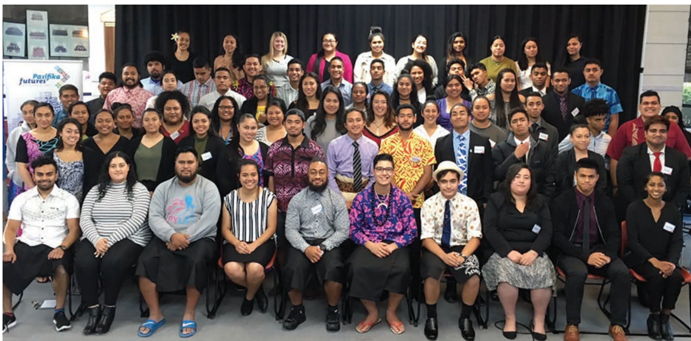
Above: Pacific Youth Parliament 2017, hosted by Pacific Youth Leadership And Transformation.