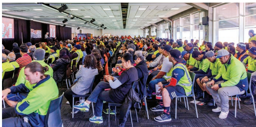
Right: Stop Work Meeting, Mt Smart stadium, 2016.