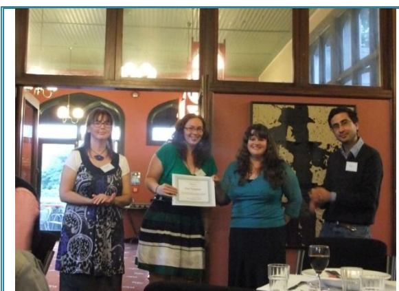
Best Postgraduate Paper in any area of political studies other than New Zealand domestic: