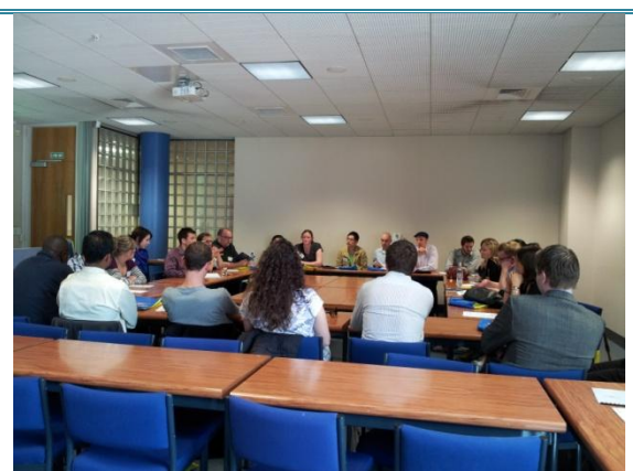
Photo from the Postgraduate Pre-Conference

With over 35 registered participants we exceeded our goals. It was wonderful to meet and interact with postgraduate students from across all of New Zealand's Universities and we hope the connections started in December continue to grow and develop. At the event we received a great deal of positive comments and helpful feedback and we are busy putting your ideas into action.